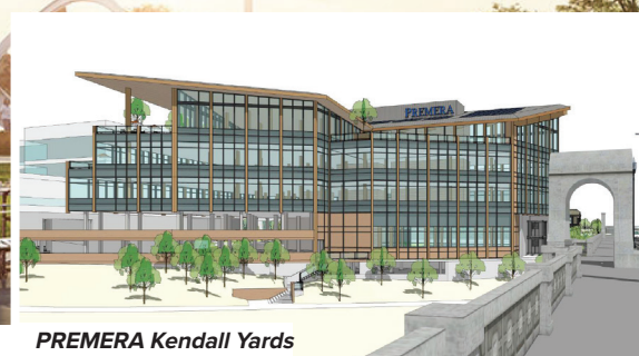
PREMIERA Kendall Yards

We are working with planners as they re-evaluate what is operationally necessary and what is the experiential re-evaluate that will differentiate their asset over - day one and well into the future. Applied across the country and around the globe, we are developing flexible systems responsive to the ubiquitous nature of anywhere access, space configuration, and reprogramming aptitude.