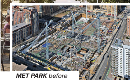
MET PARK before